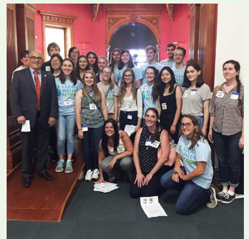
Clean Water Action's Canvass brings the issues straight to legislators in Trenton at our Stop Dirty Pipelines Lobby Day.

Republican legislators have already signed a letter urging NJDEP to deny a key water quality permit it needs.